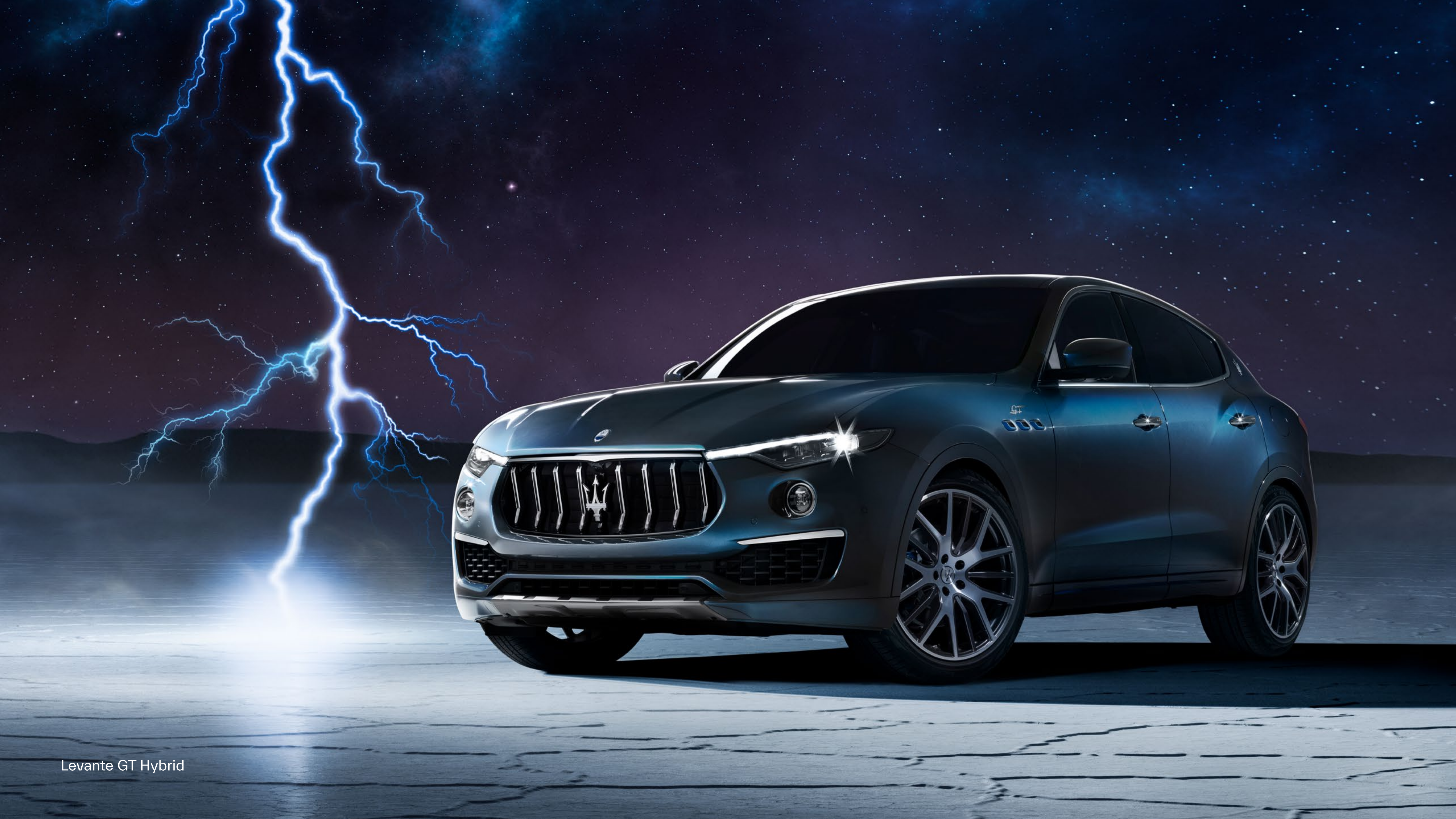
Levante GT Hybrid