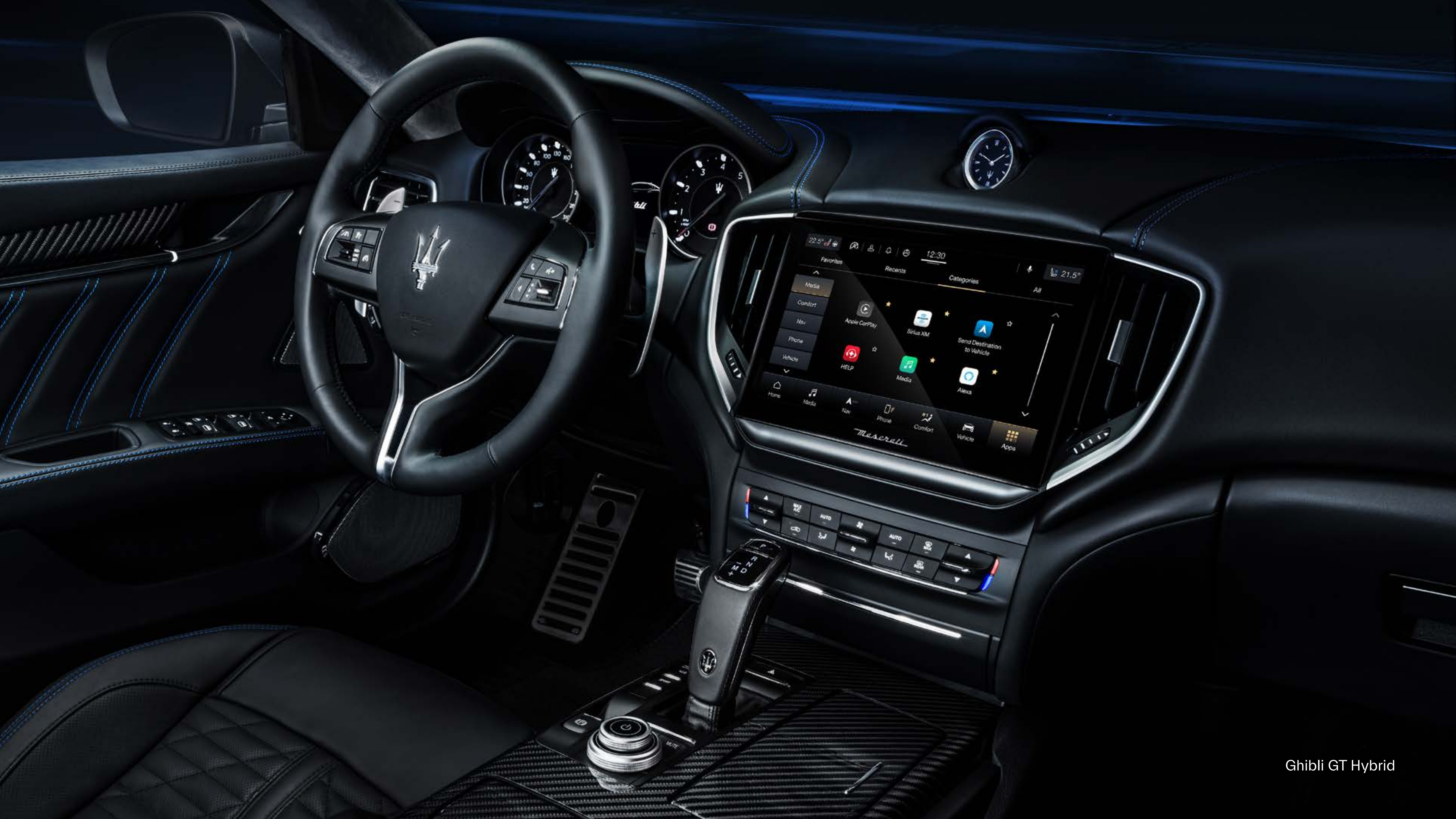
Ghibli GT Hybrid